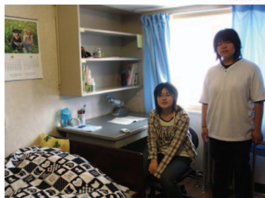
▲ 居室 Room