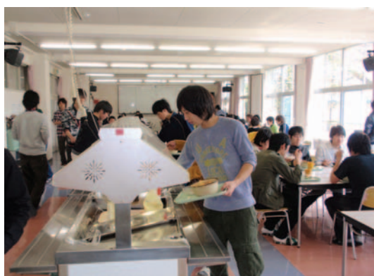
▲ 食堂 Dining Hall